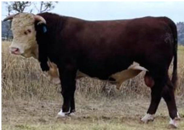
Lot 11 – Glenholme United