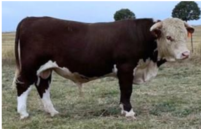
Lot 9 – Kirraweena Ultan