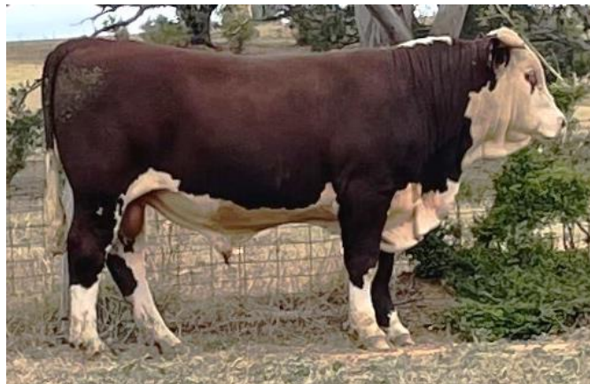
Lot 24 – Kirraweena Uberto