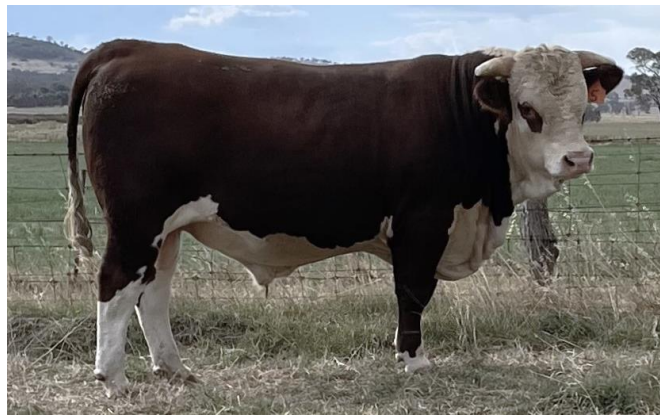
Lot 5 – Kirraweena Urquhart