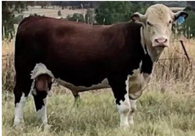
Lot 22 – Glenholme Umpteen