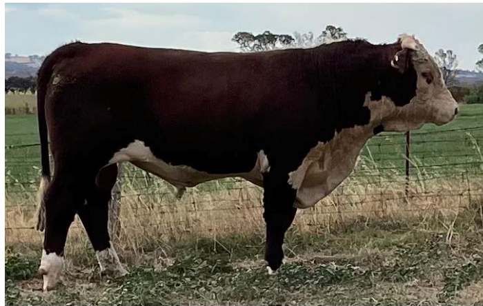
Lot 7 – Kirraweena Universal