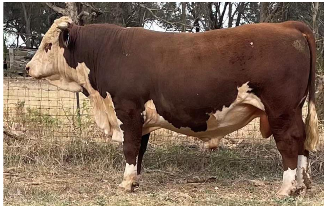
Lot 28 – Glenholme Ulf