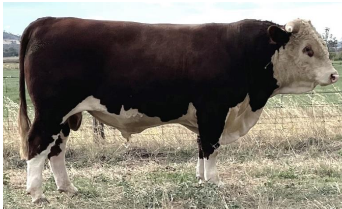
Lot 4 – Kirraweena Uptown