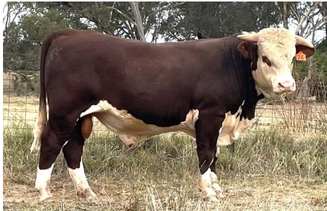
Lot 26 – Kirraweena Uncle Buck