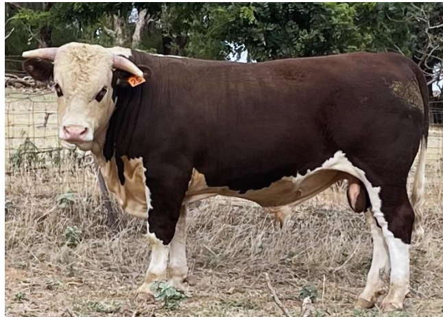
Lot 25 – Kirraweena Ultra U236