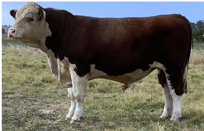
Lot 20 – Glenholme Ureka