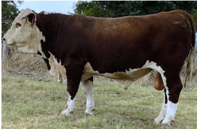
Lot 14 – Kirraweena Upgrade