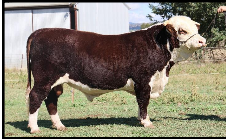
Kirraweena Tariq (H) (Sire: Karoonda Warship) Sold Wodonga 2024 for $22,000 to Homeleigh Herefords CONSISTENTLY BREEDING QUALITY, EASY DOING, QUIET HEREFORDS