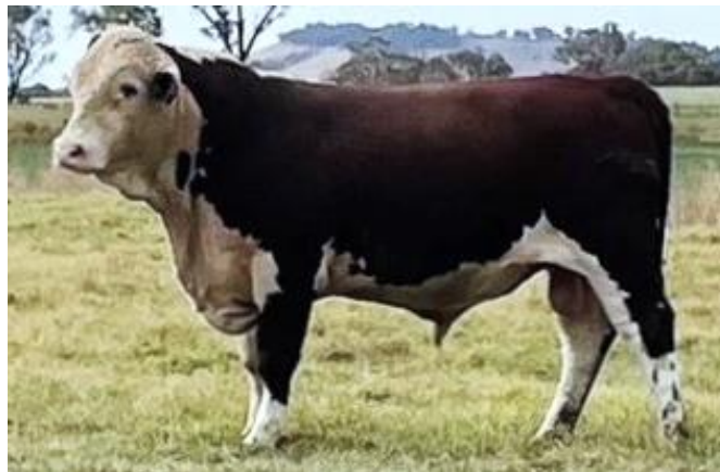
Lot 21 – Glenholme Unite