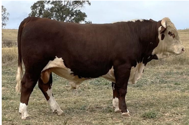
Lot 6 – Glenholme Ulan