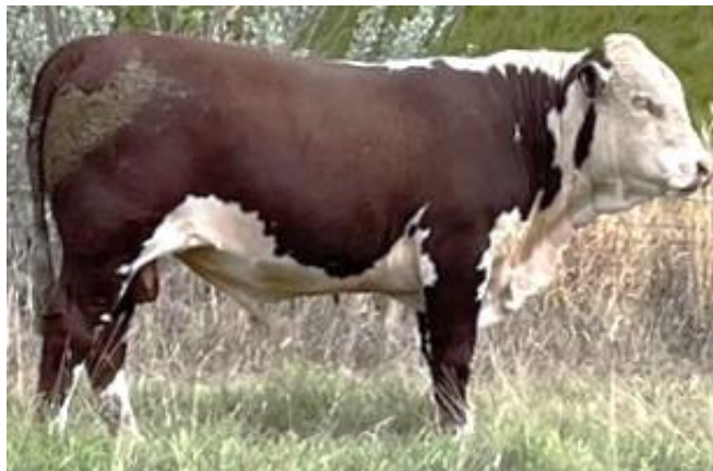
Lot 17 – Glenholme Upturn