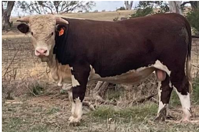
Lot 27 – Kirraweena University