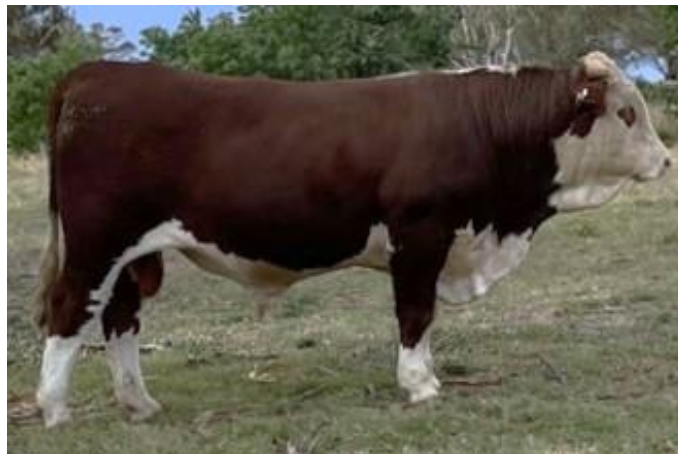
Lot 8 – Kirraweena Umpire