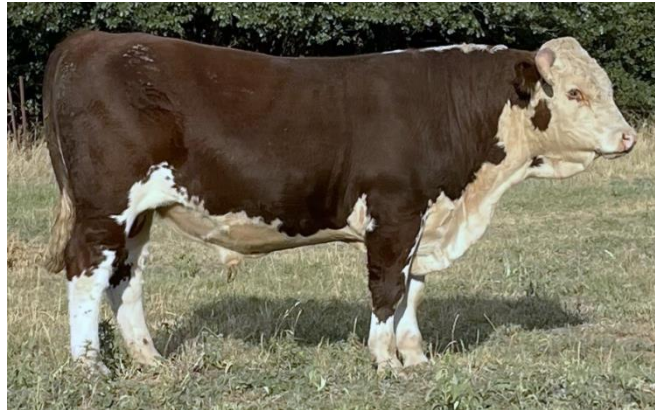
Lot 15 – Kirraweena Ultimate